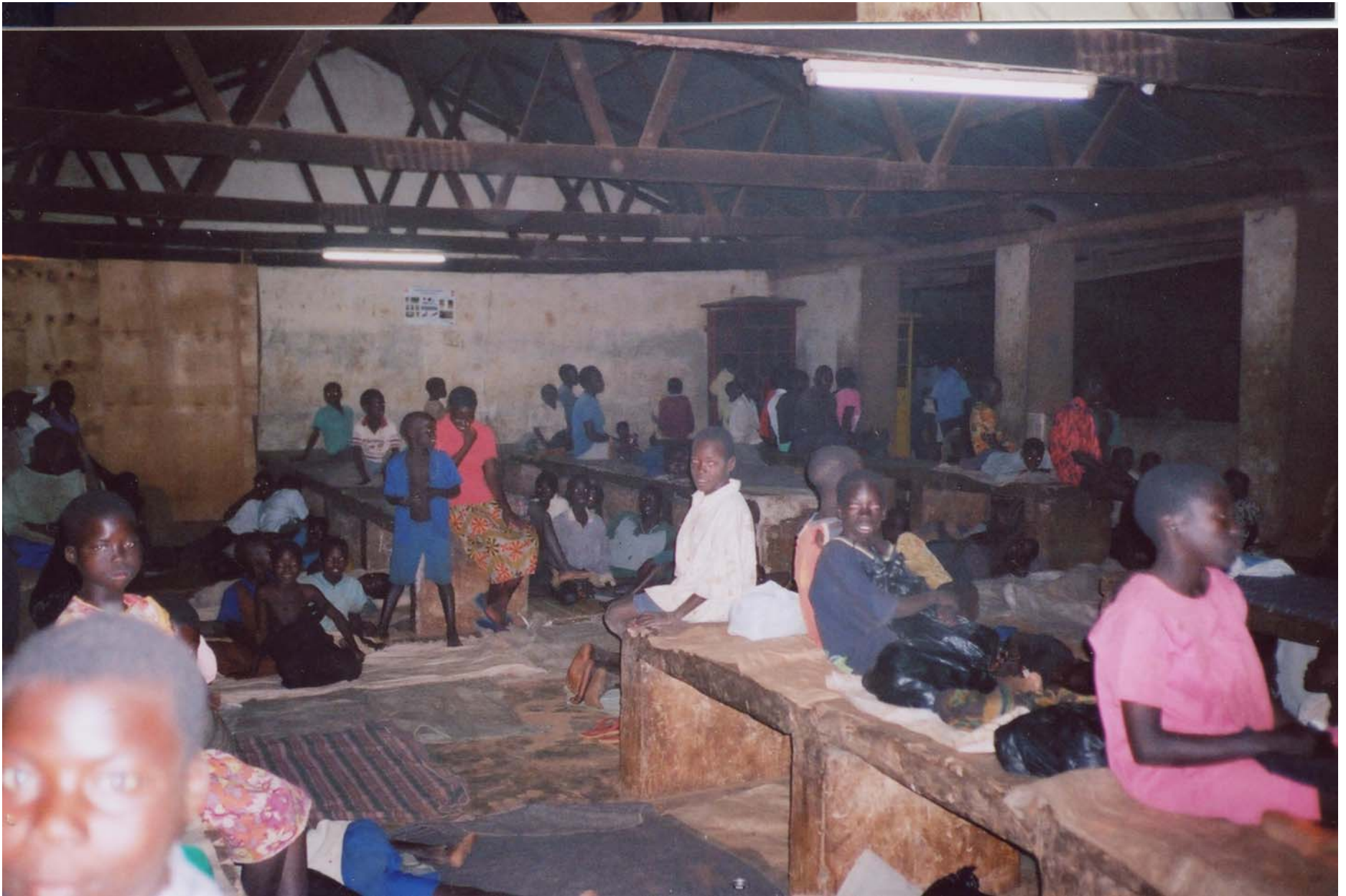
Children known as "night commuters" sleep at the bus terminal in Gulu, seeking safety from LRA abduction.