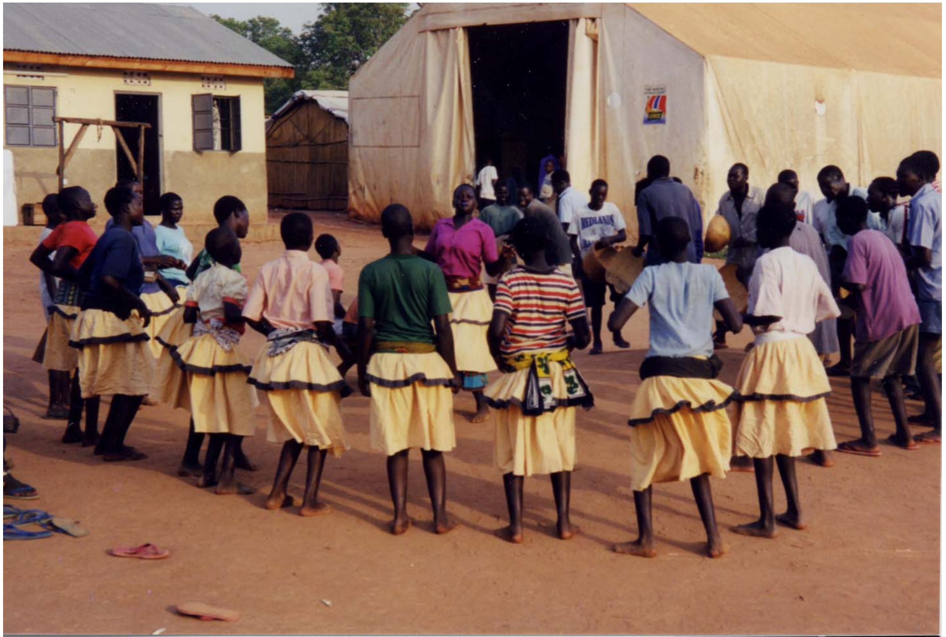
Children who had been abducted by the LRA dance at the GUSCO rehabilitation center.