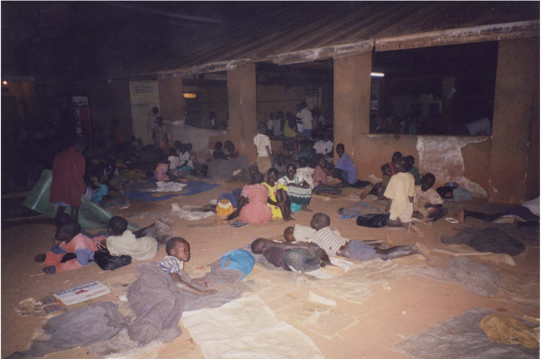
Children known as "night commuters" sleep at the bus terminal in Gulu, seeking safety from LRA abduction.