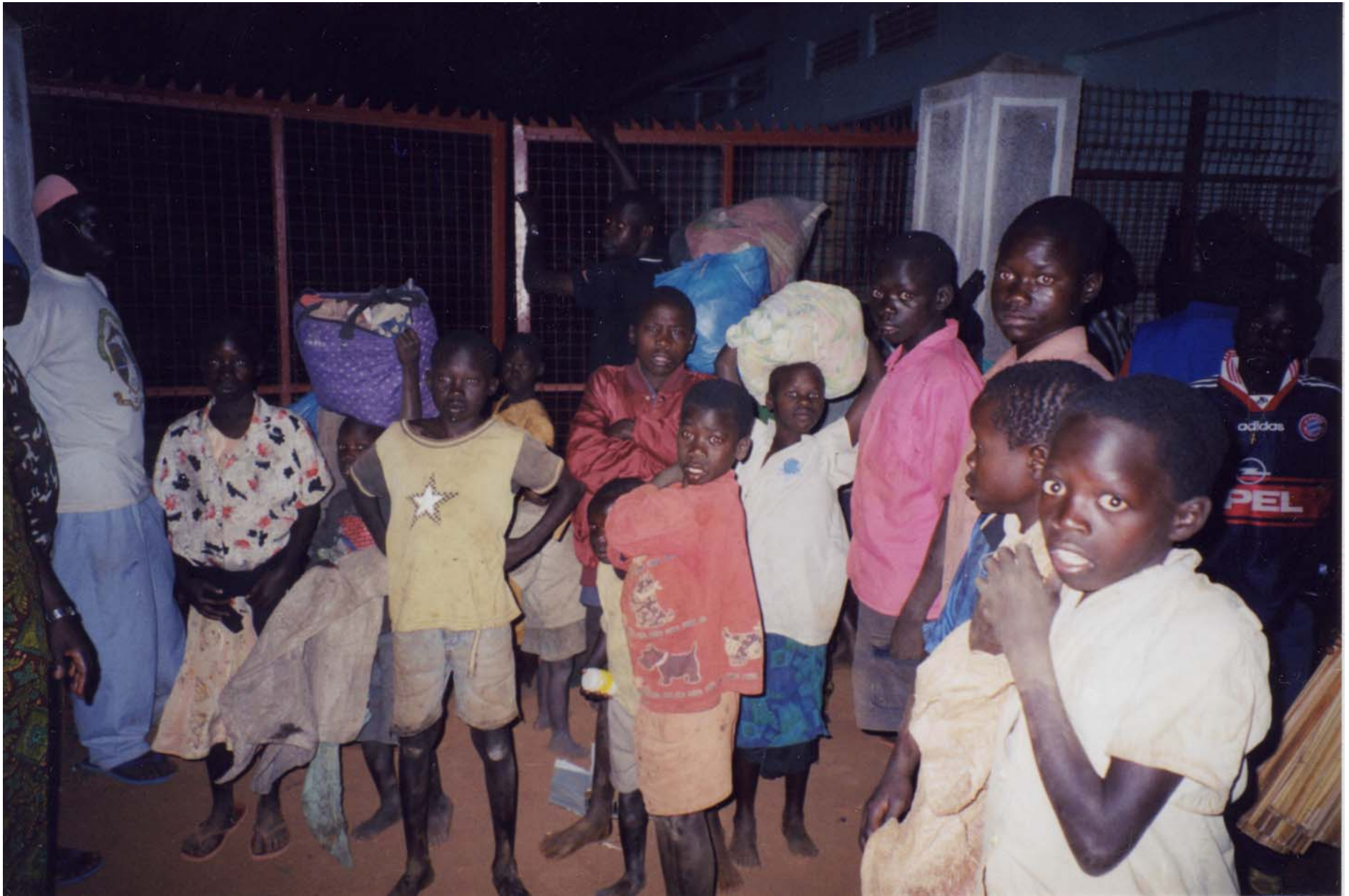
"Night commuters" seeking safety from LRA abductions wait at the gate of a local church, hoping to sleep on church grounds.